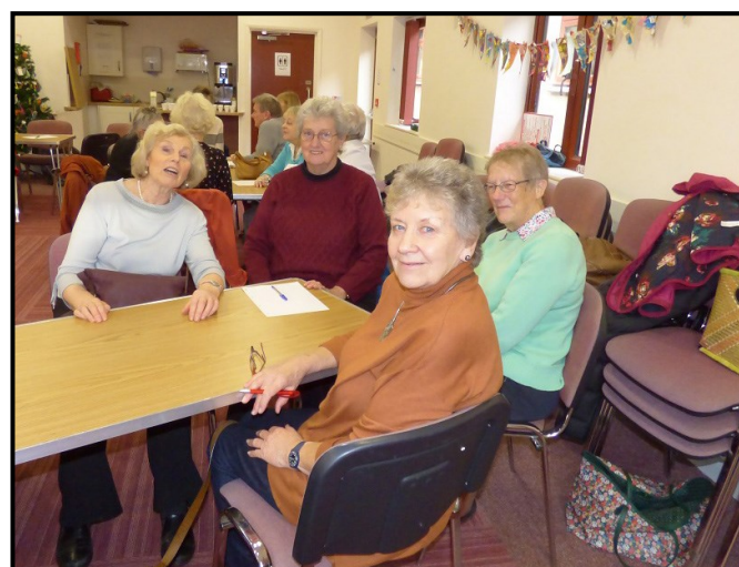
Quiz masters, Feast, 2 of the teams.