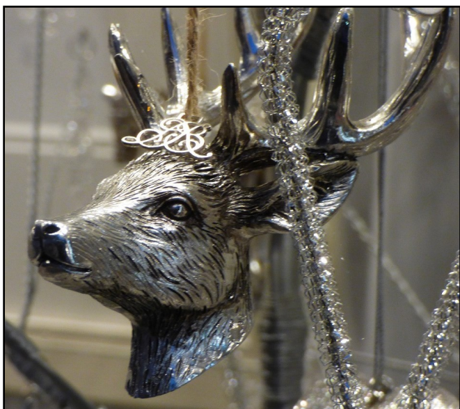
Silver deer head in shop window.