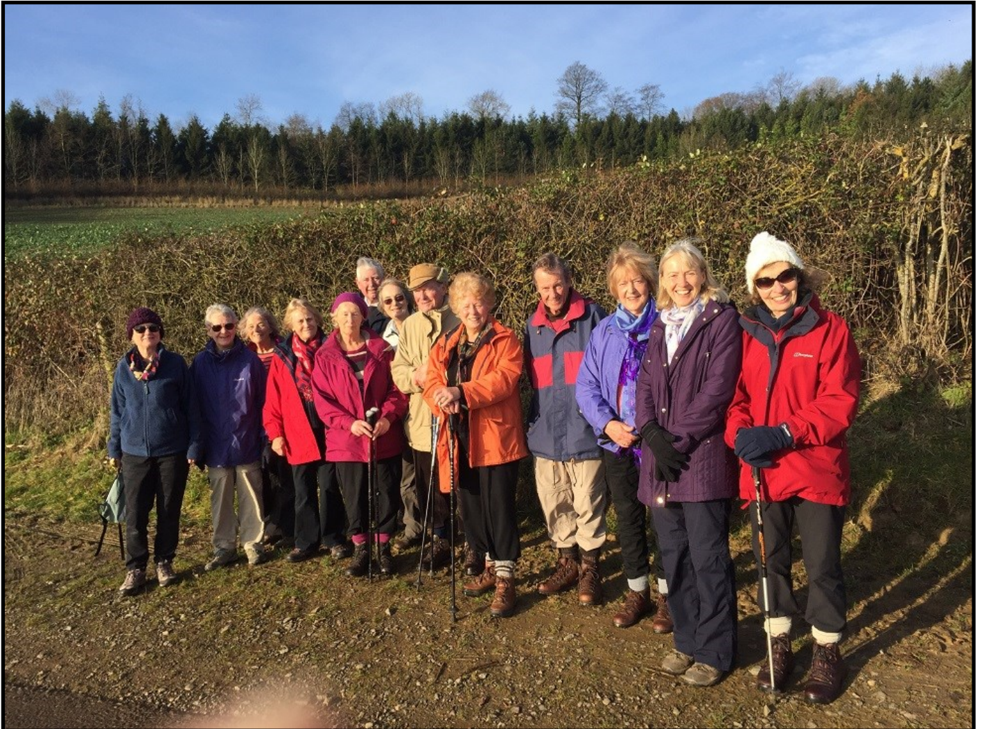
Group Photograph during the walk

I chose this walk as they have opened a communi- Article and Photograph by Valerie Redfern.