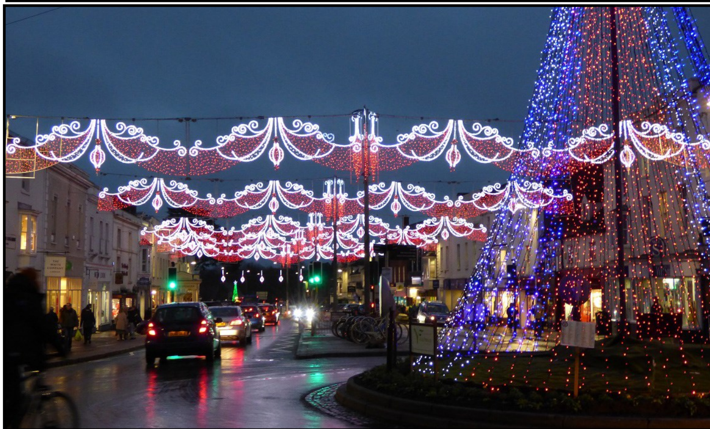
Christmas Lights in Bridge Street

Pictured above is the Shakespeare Birthplace Lightshow December 2014